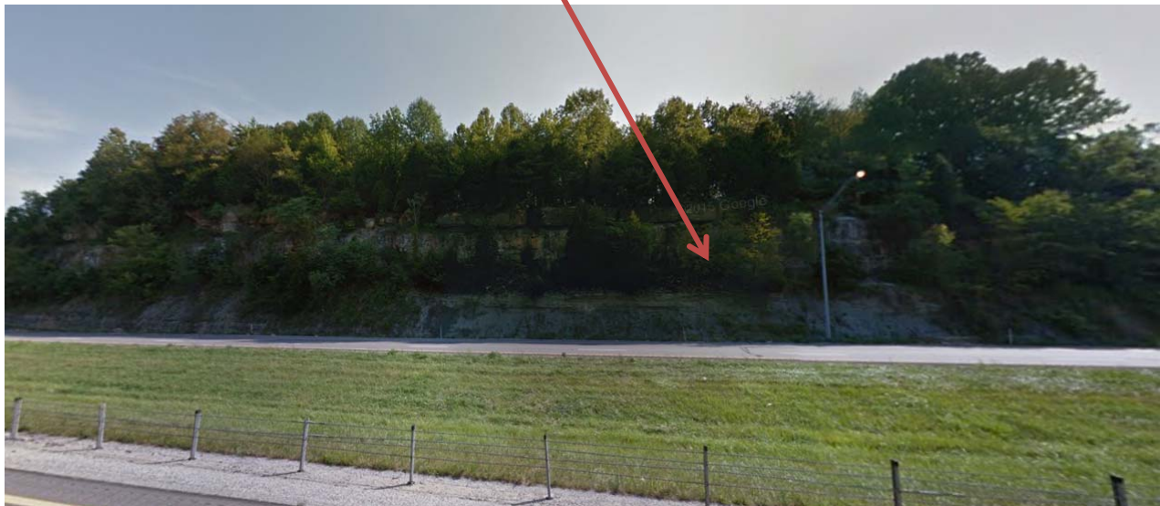
HM 9 (General location)

HM9 is located near the end taper for Ramp B. The rock wall is proposed to be graded to accommodate the road widening. Tree removal is required to install the pole.