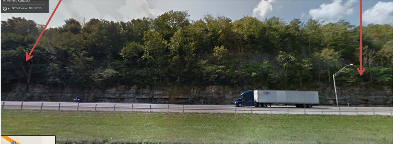
HM2 (General location)

HM9 is located near the end taper for Ramp B. The rock wall is proposed to be graded to accommodate the road widening. Tree removal is required to install the pole.